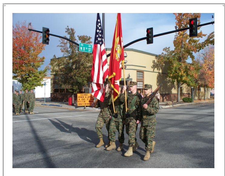
Color Guard from Co "C", 4th Tank Bn